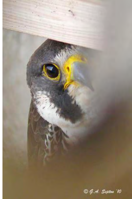
Above: Amylase photographed thru a peephole at her nest box

Adult Male: Believed to be-"JJ" (b/g) 96/N , produced in 2005 at the Renew Energy site at Jefferson, WI - the old Ladish/Cargill site here for his second year.