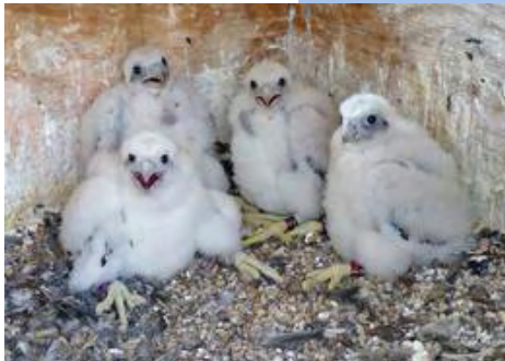
Above: P/63 Left: The 4 youngsters