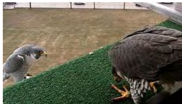
Above: Web cam images showed promise here this spring but 2 of the 3 females ID’d here nested at other Milwaukee area sites.