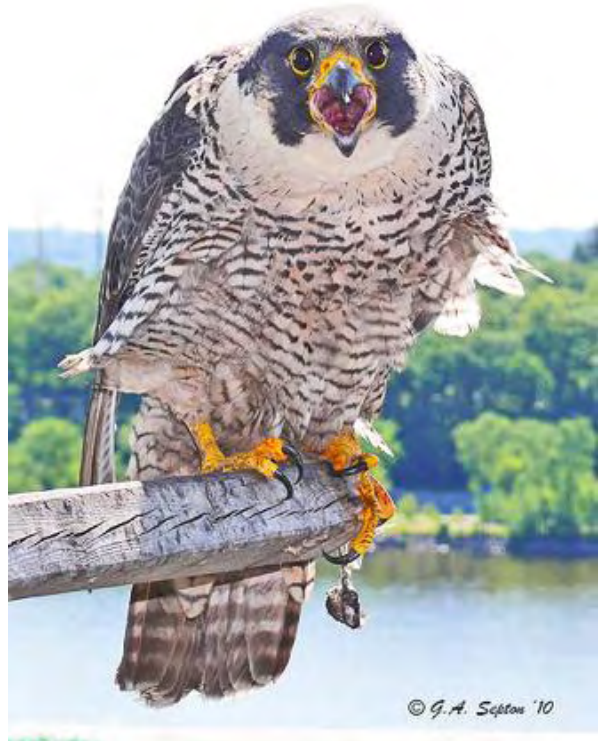
Left: The 2010 youngsters Above: The unbanded adult female

This site has been active since 2008 producing a total of 4 young (2.0/year).