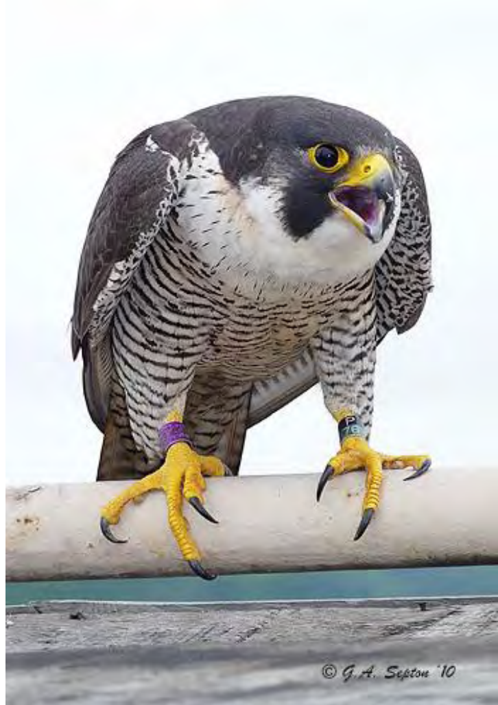
Left: The small, lone male on banding day Above: Nora atop her nest box

Eggs: 4 Laid between April 14 – 20 Projected Hatch Dates: May 22 – 24 Eggs Hatched: 1 on May 24 Banded: 1 Male on June 14