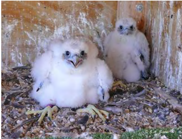
Left: Ceres & LeFloch on banding day

Eggs: 1 observed between April 26 – May 3 4 observed on June 2 Projected Hatch Dates: June 9 – 11 Eggs Hatched: 2 on June 12 Banded: 1 Female & 1 male on July 1